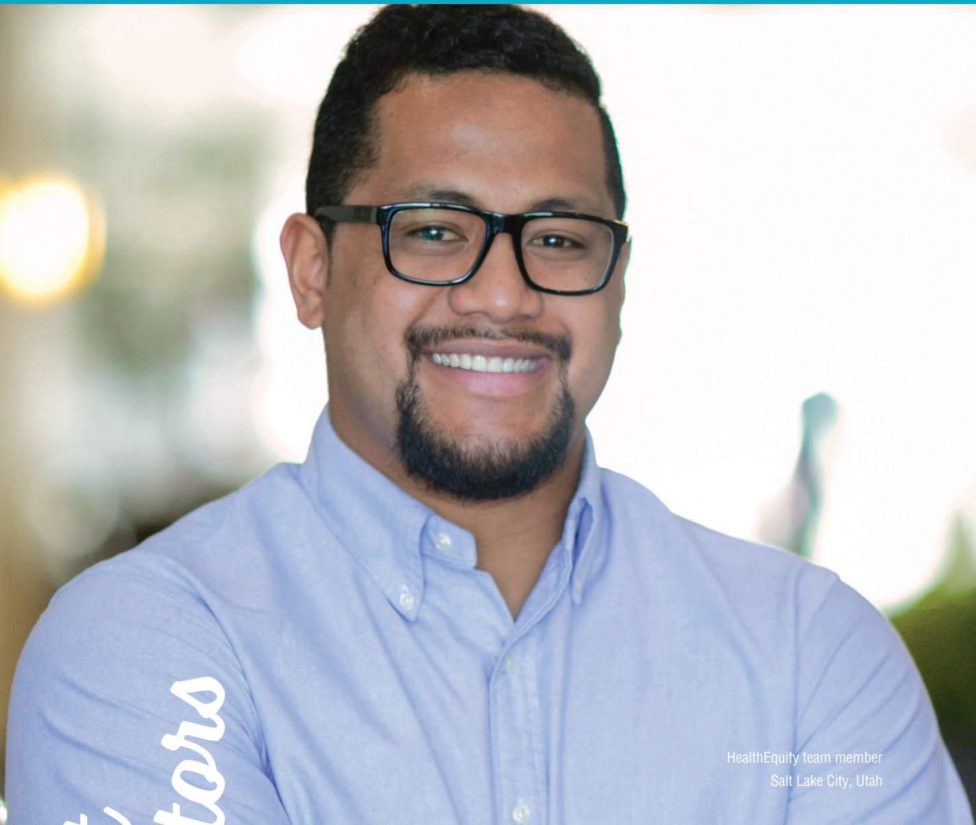
HealthEquity team member Salt Lake City, Utah